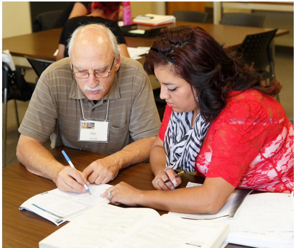
A tutor helps a young mother prepare for a high school equivalency exam.