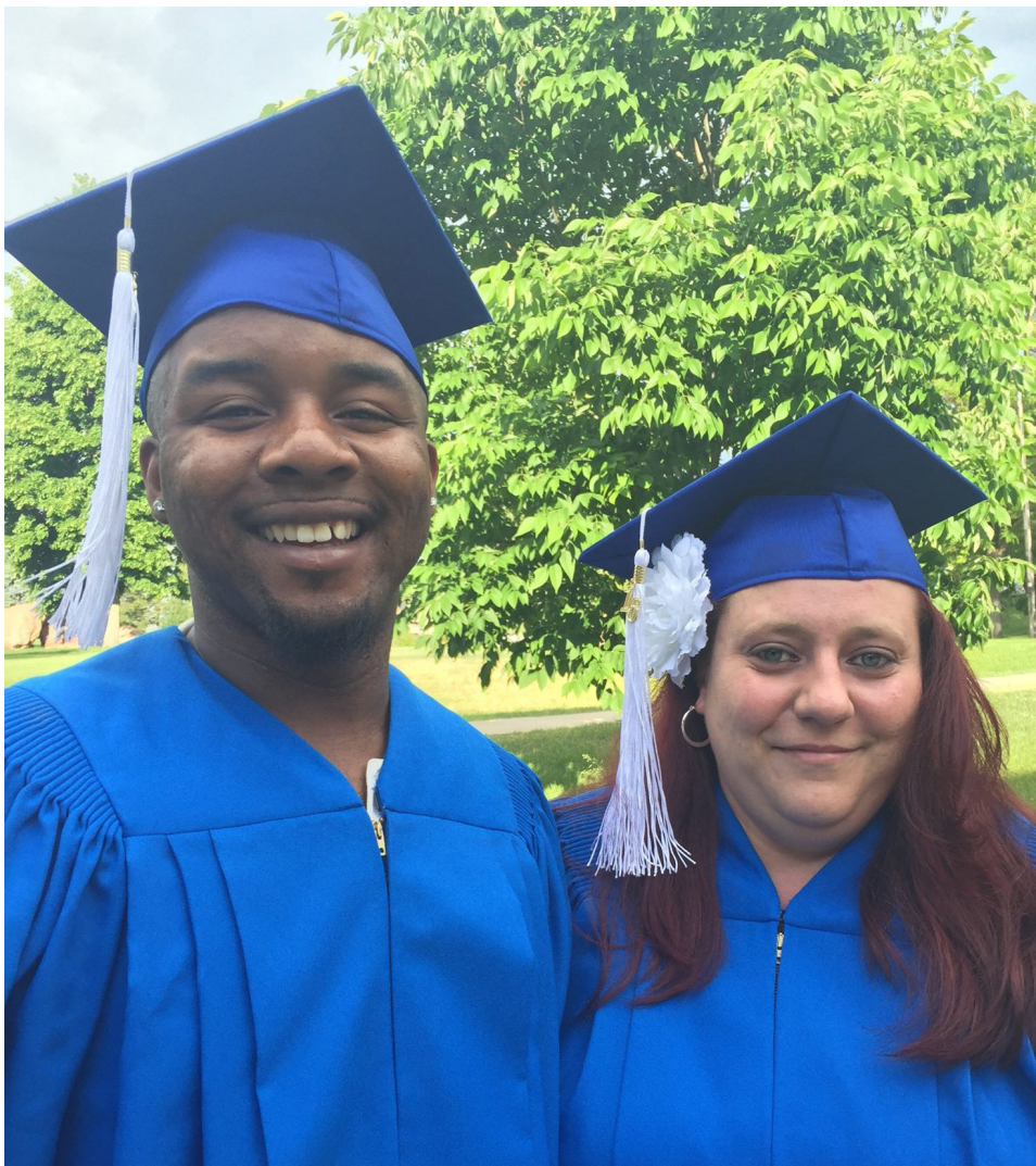
Proud CWEE graduates who received their high school equivalency.

We will advocate for funding for the adult education system and the family resource centers as well as for passage of legislation similar to HB16-1050. In addition, we will advocate for expanding the number of slots in the Colorado Preschool Program that serves children from low-income and at-risk families and for improvements in the Cliff Effect Pilot Program as part of CCCAP. Both of these issues address policies that the key informants suggested could help advance better links in this area.