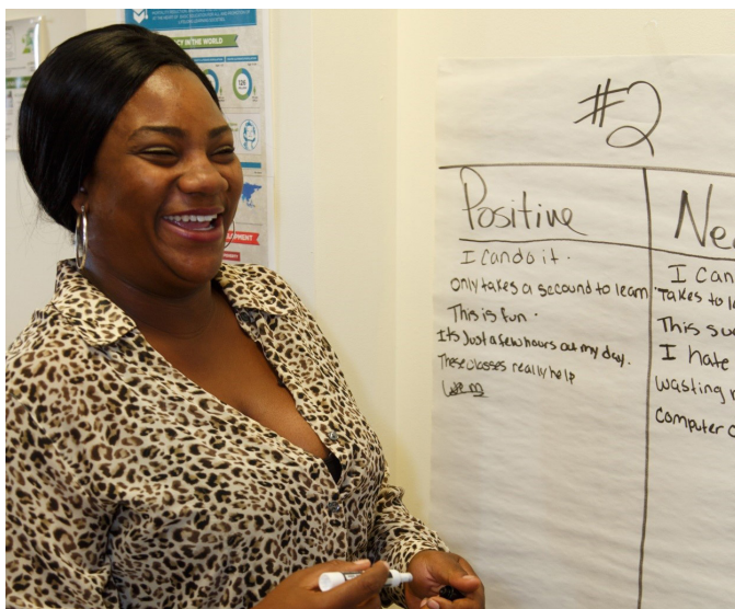
A member of one of CWEE's education programs learns new skills.